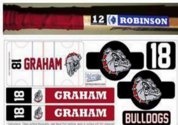
Helmet & Bottle Decals